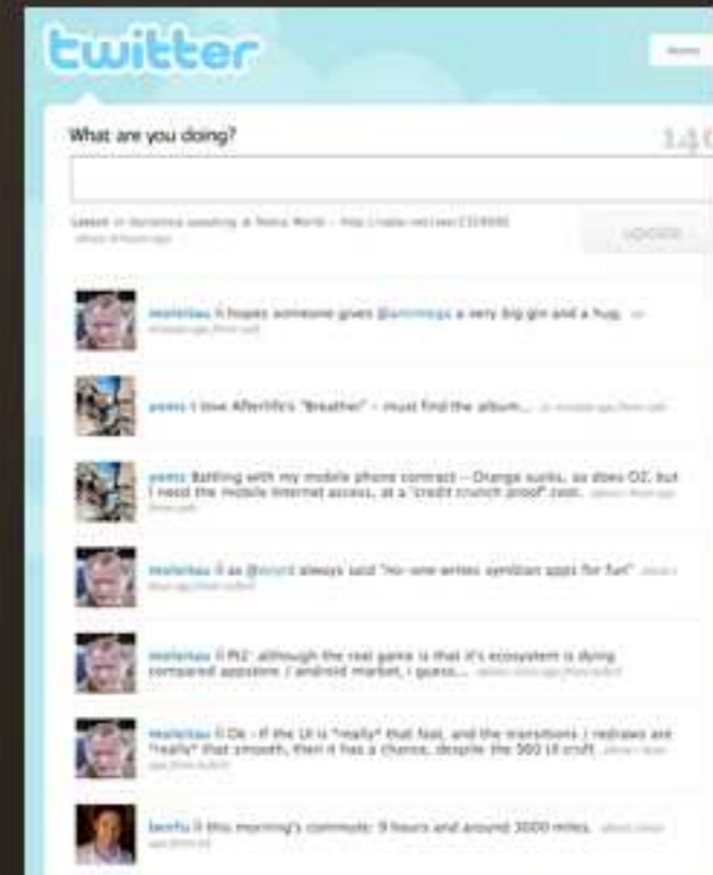
the broadcast stream of consciousness