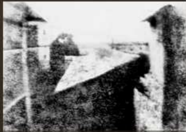
recording the material world