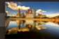
"the best photo sharing site in the world"