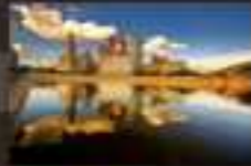
"the best photo sharing site in the world"