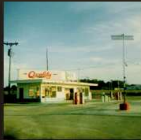
vacation shots: we were here