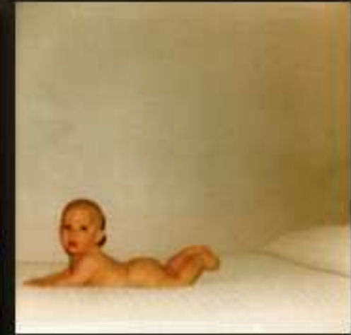
candid: this is happening now