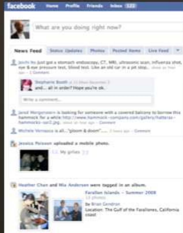
friends sharing snapshots