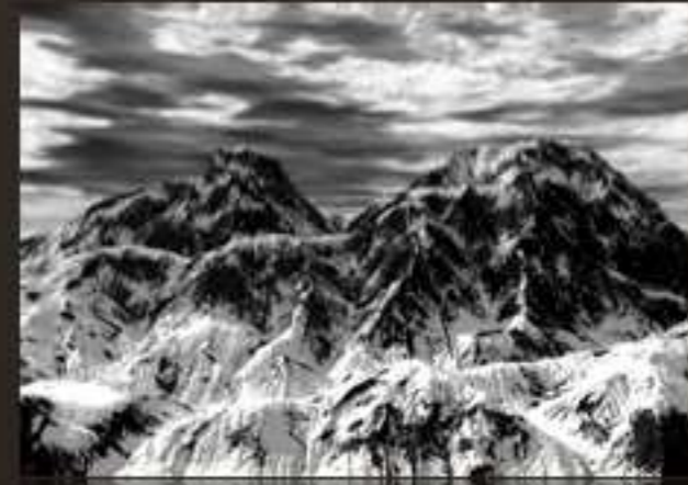
photography as art